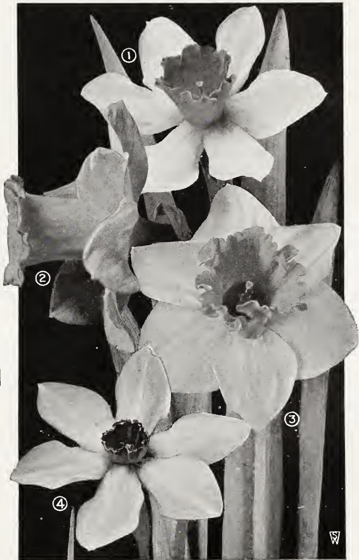
Giant and Medium Trumpet Narcissi